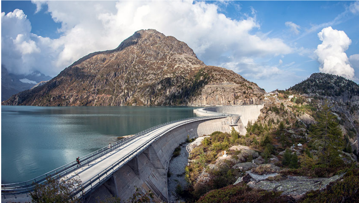
Dams can form barriers that obstruct the migration of aquatic organisms.